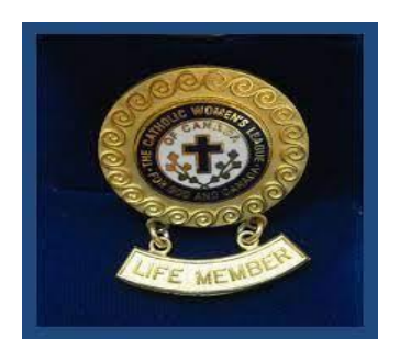
Life Member Liaison Report 2023